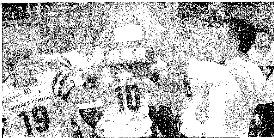
Members of the Grundy Center football team hoist the state runner-up trophy after last Thursday's 21-17 loss to West Hancock in the Class A championship at the UNI-Dome in Cedar Falls.

like-class uy a is an ar at d me to be asked can't acter and ilies better -plus l the more game com- tans' terfi- on a